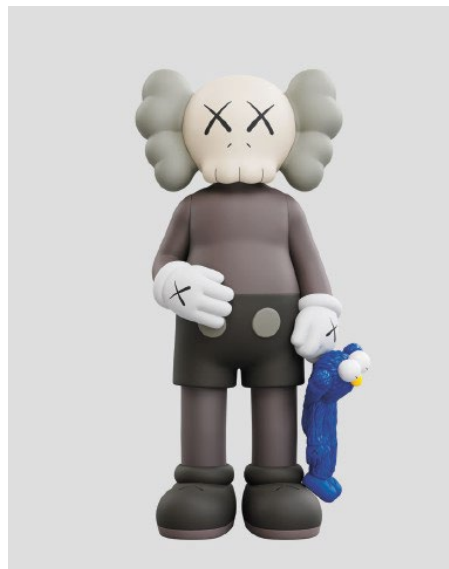
KAWS SHARE, 2019 © KAWS

Comics are conceived of as a universal mode of graphic narration in this survey of how they interact with contemporary artistic stances. Comic characters, with their universal codes that speak to all age groups and social classes, guide visitors through this presentation.