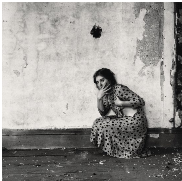
Francesca Woodman Polka Dots, Providence, Rhode Island, 1976/2000 Black and white silver gelatine print on baryta paper 13,1 x 13,2 cm Verbund Collection, Vienna

The artist created her oeuvre during an eight-year period that began in 1973 and ended with her suicide in 1981. Her works are characterized by passionate self-staging and the female body's creative positioning within spatial configurations in the context of conceptual photography and performance. The themes of her works revolve around femininity, vulnerability, and creative portrayal of the self. The VERBUND COLLECTION has been acquiring photographs by Woodman ever since its establishment in 2004. Now totaling around 80 works, 20 of them vintage, the holdings represent one of the most comprehensive collections of works by this exceptional artist. Their presentation is completed by works from international lenders.