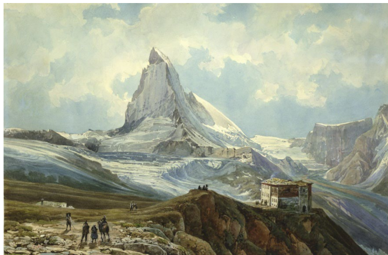
Thomas Ender The Matterhorn seen from the Gornergrat, 1854 Watercolor 33,3 x 50,3 cm The ALBERTINA Museum, Vienna

The focus here ranges from the »grand tour« to journeys of discovery, emphasizing the various depicted landscapes and motifs as well as engagement with nature in works by figures from Johann Wolfgang von Goethe to Jakob Alt and Thomas Ender to Tina Blau. Delicate drawings and vivid watercolors enable viewers to sense for themselves that era’s yearning for new horizons and individual experiences of nature as well as the conditions under which travel took place.