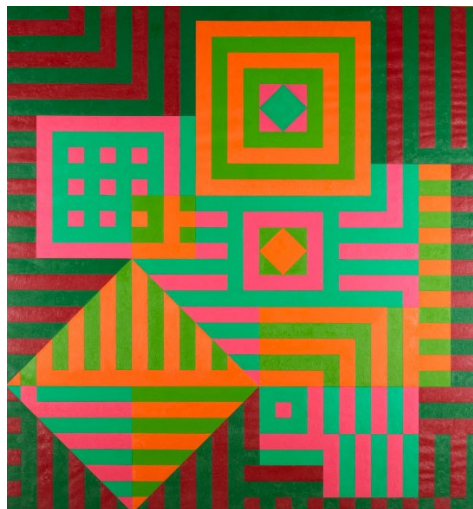
Victor Vasarely Kiu-Siu, 1963 Oil on canvas 214 x 202 cm The ALBERTINA Museum, Vienna – The ESSL Collection