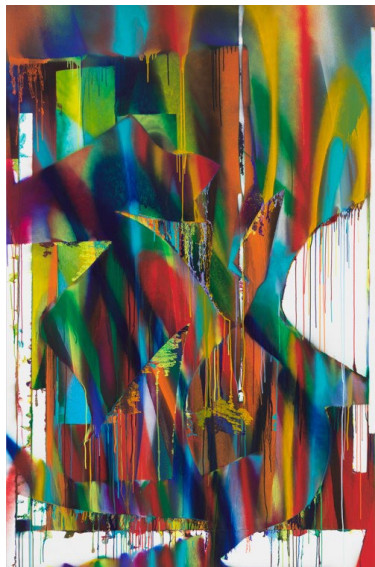
Katharina Grosse Untitled, 2018 Acrylic on canvas 290 x 193 cm Viehof Collection

The exhibition brings together contradictory stances like Jörg Immendorff's sweeping large-format works juxtaposed with the conceptual works of Joseph Beuys as well as works by Anne Imhof, Katharina Fritsch, and Nairy Baghramian, which strike an entirely different tone. In this, one sees how the principle of national artistic schools has long since given way to one of individual styles.