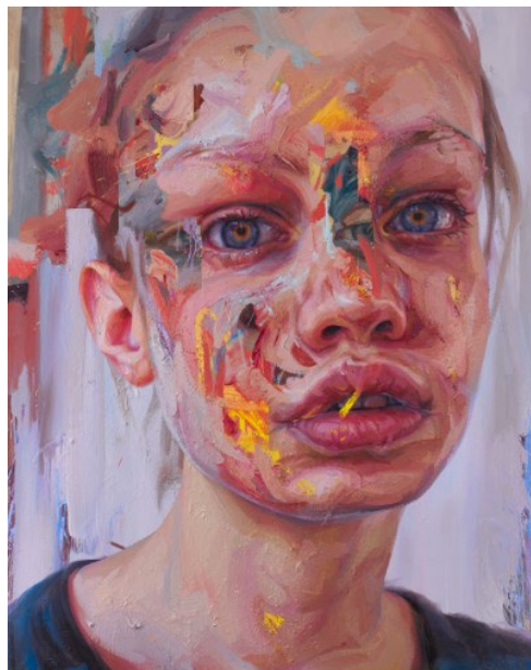
Jenny Saville Gaze, 2021–2024 Oil and acrylic on linen 200 × 160 cm Private collection © Jenny Saville / Bildrecht, Vienna 2024

Since the 1990s, she has been creating emphatically corporeal portrayals that stand out for their directness and immediacy. This exhibition offers a glimpse into Saville's oeuvre of the past two decades while also presenting new, yet-unseen works.