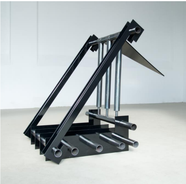
Toni Schmale waltraud , 2016 Powder-coated steel in RAL 9005, heat-treated and waxed steel, concrete 170 x 110 x 80 cm