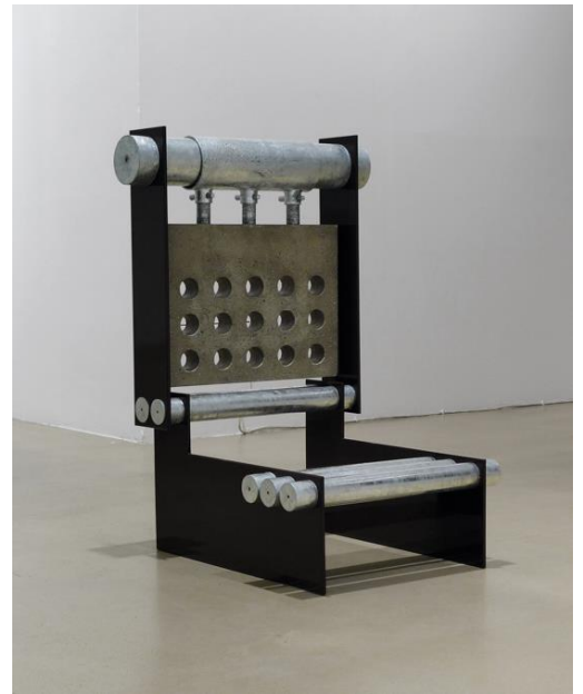
Toni Schmale lap , 2013 Powder-coated steel in RAL 8017, concrete 101 x 65 x 60 cm