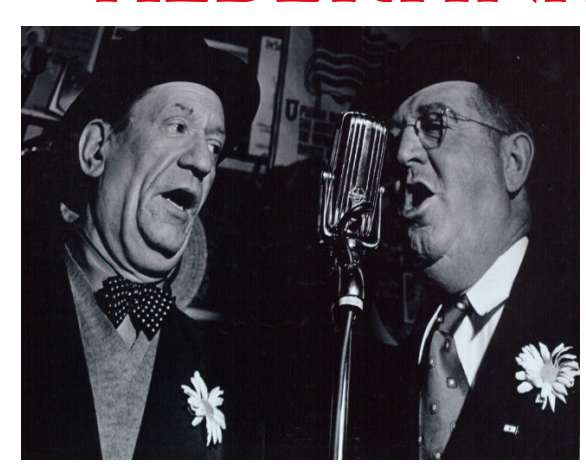
Lisette Model Singer at the Cafe Metropole, New York City, 1946 Gelatin silver print 49,6 x 39,8 cm The ALBERTINA Museum, Vienna © 2025 Estate of Lisette Model, courtesy Lebon, Paris / Keitelman, Brussels

Lisette Model Sammy's Bar, New York City, 1940-1944 Gelatin silver print 37,8 x 49 cm The ALBERTINA Museum, Vienna – Permanent Loan Austrian Ludwig Foundation for Arts and Science © 2025 Estate of Lisette Model, courtesy Lebon, Paris / Keitelman, Brussels