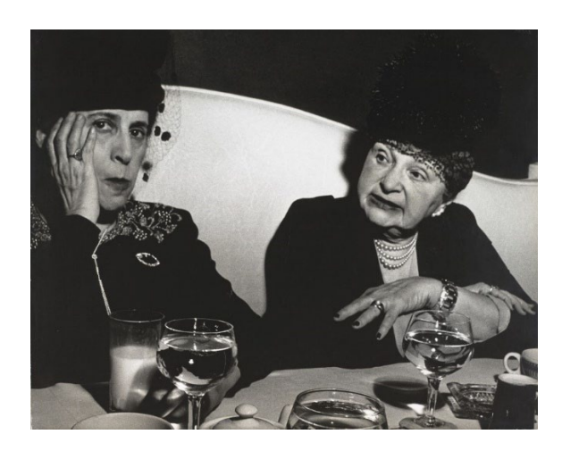
Lisette Model Fashion Show, Hotel Pierre, New York City, 19401946 Gelatin silver print 39,3 x 49,2 cm The ALBERTINA Museum, Vienna, Permanent Loan Austrian Ludwig Foundation for Arts and Science © 2025 Estate of Lisette Model, courtesy Lebon, Paris / Keitelman, Brussels

Lisette Model Sammy's Bar, New York City, 1940-1944 Gelatin silver print 37,8 x 49 cm The ALBERTINA Museum, Vienna – Permanent Loan Austrian Ludwig Foundation for Arts and Science © 2025 Estate of Lisette Model, courtesy Lebon, Paris / Keitelman, Brussels