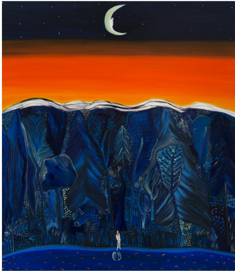
Matthew Wong End of the Day, 2019 Oil on canvas 200 × 180 cm The Metropolitan Museum of Art, New York, Gift of Monita and Raymond Wong in memory of their son, Matthew Wong, 2023

The following images are available free of charge in the Press section of www.albertina.at . Legal notice: The images may only be used in connection with reporting on the exhibition.