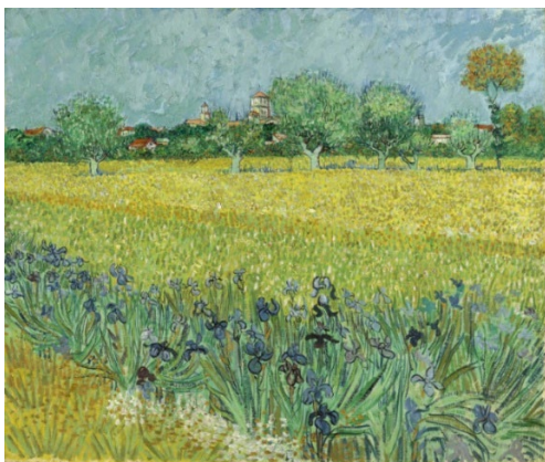
Vincent van Gogh Field with Irises near Arles, 1888 Oil on canvas 55 × 65 cm Van Gogh Museum, Amsterdam (Vincent van Gogh Foundation)