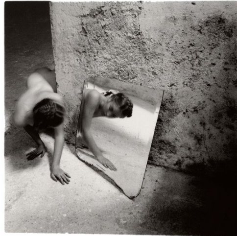
Francesca Woodman Self Deceit #1, Rome, Italy 1978/1979 Black and white silver gelatine print on baryta paper 9 x 9 cm Verbund Collection, Vienna © 2025, Woodman Family Foundation / Bildrecht, Vienna