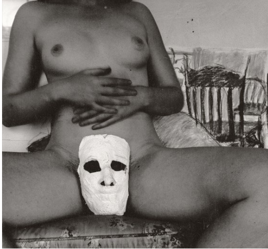
Francesca Woodman Face, Providence, Rhode Island, 1975-1976/1997-1999 Black and white silver gelatine print on baryta paper 12 x 12,5 cm Verbund Collection, Vienna

The following images are available free of charge in the Press section of www.albertina.at . Legal notice: The images may only be used in connection with reporting on the exhibition.