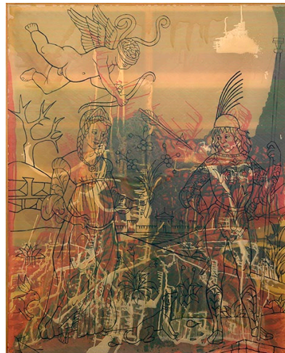
Sigmar Polke Cupido, Desire, 1997 Plastic seal, synthetic resin on polyester fabric 350 × 280 cm Viehof Collection, former Speck Collection © The Estate of Sigmar Polke, Cologne / Bildrecht, Vienna 2025