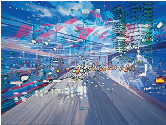
Corinne Wasmuht Pathfinder, 2002 Oil on wood 243 x 324 cm Viehof Collection