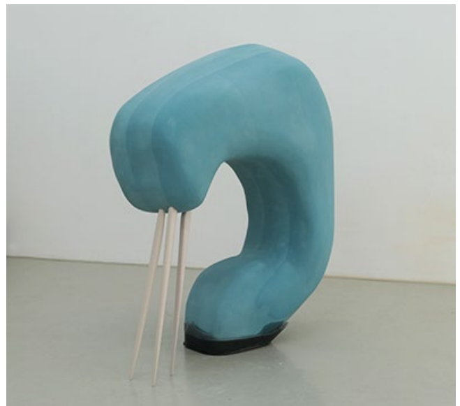
Nairy Baghramian Treat, 2006 Lacquer, bronze 41,9 x 101,6 x 50,8 cm Viehof Collection © Nairy Baghramian