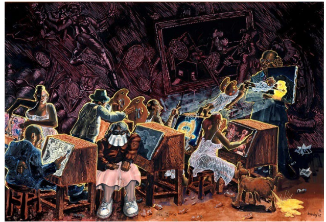
Jörg Immendorff Beautiful Voices, 1994-95 Oil on canvas 300 x 440 cm Viehof Collection