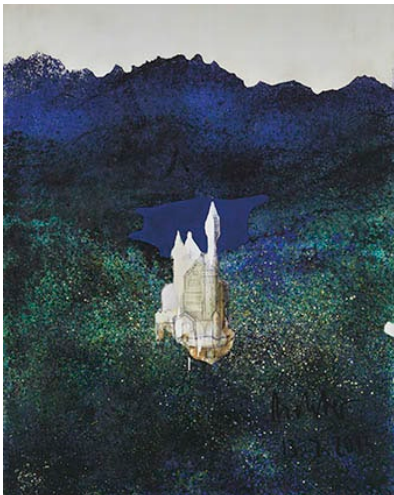
Gerhard Richter Neuschwanstein Castle (1963), 2013 Reprint, print on Canson Photo Satin mounted on Re-board 190 × 150 cm Viehof Collection © Gerhard Richter 2025 (27032025)