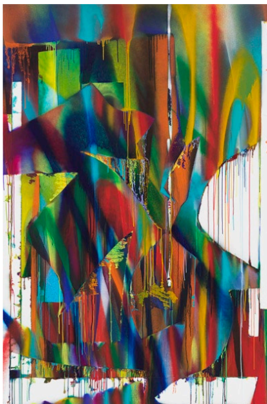
Katharina Grosse Ohne Titel, 2019 Acrylic on canvas 290 x 193 cm Viehof Collection © Katharina Grosse / Bildrecht, Vienna 2025