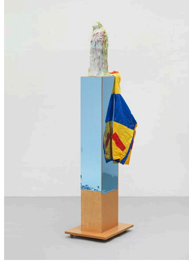
Isa Genzken Dedicated to the Statue of Liberty, 2015 Plaster, paint, mirror foil, plastic, MDF 190 × 50 × 50 cm Viehof Collection © Bildrecht, Vienna 2025, Photo: Jens Ziehe