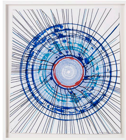
Damien Hirst Beautiful Temporarily Lost At Sea Drawing, 2008 Pastel and ink on paper 47 × 42 cm