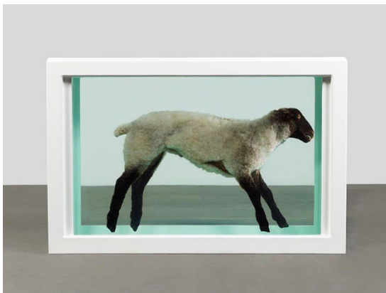
Damien Hirst Away from the Flock, 1994 Glass, painted steel, silicone, acrylic, plastic cable ties, lamb, and formaldehyde solution 96 × 149 × 51 cm Photographed by Prudence Cuming Associates Ltd © Damien Hirst and Science Ltd. All rights reserved/ Bildrecht, Vienna 2025