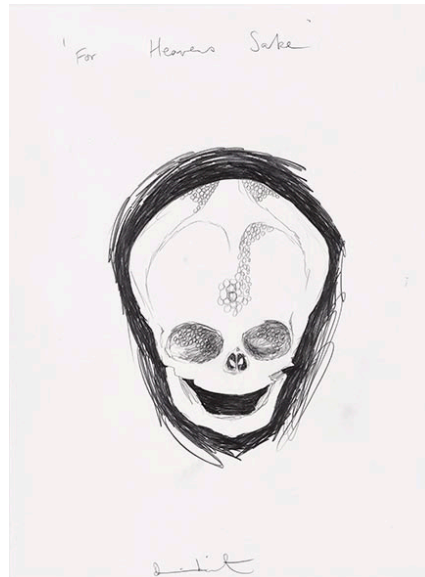
Damien Hirst For Heaven's Sake Drawing I, 2008 Pencil on paper 76 × 56 cm