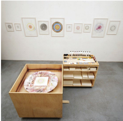
Damien Hirst Making Beautiful Drawings, 1994 Mixed media Dimensions variable Installation view, Making Beautiful Drawings, Bruno Brunnet Fine Arts, Berlin, 1994 © Damien Hirst and Science Ltd. All rights reserved/ Bildrecht, Vienna 2025

The following images are available free of charge in the Press section of www.albertina.at . Legal notice: The images may only be used in connection with reporting on the exhibition.