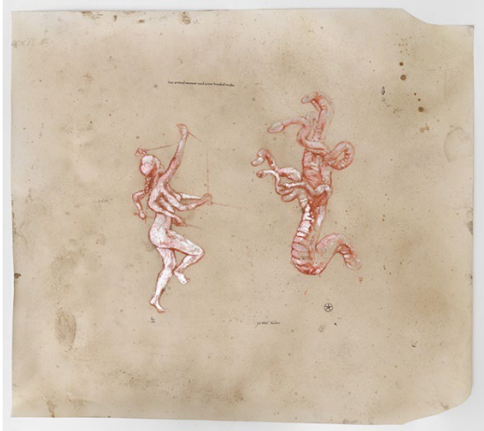
Damien Hirst Kali Confronts Hydra, 2015 Pencil, ink and silver leaf on vellum 59 × 72 cm