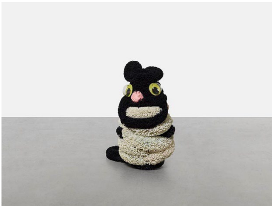
Damien Hirst Cat, 2018 Steel, aluminium, polypropylene, acrylic adhesive, epoxy resin, nylon, PETG, acrylic and copper wire 77 × 62 × 56 cm © Damien Hirst and Science Ltd. All rights reserved/ Bildrecht, Vienna 2025