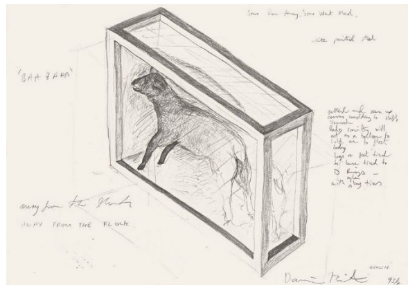
Damien Hirst Away from the Flock, 1994 Pencil on paper 50 × 73 cm Photographed by Stephen White © Damien Hirst and Science Ltd. All rights reserved/ Bildrecht, Vienna 2025