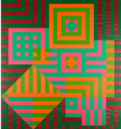
Victor Vasarely Kiu-Siu, 1963 Oil on canvas 214 x 202 cm The ALBERTINA Museum, Vienna – The ESSL Collection © Bildrecht, Vienna 2025

Legal notice: The images may only be used in connection with reporting on the exhibition.